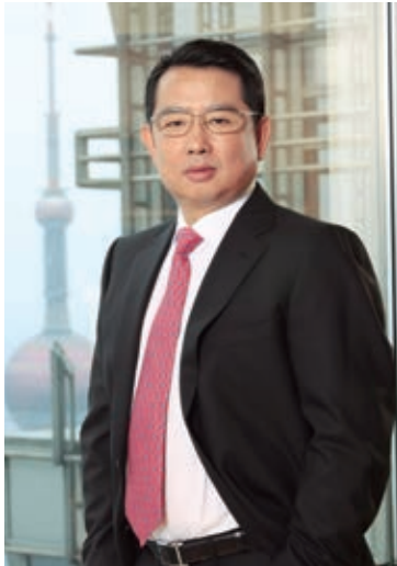
Far East Horizon Limited Vice Chairman of the Board and Chief Executive Officer