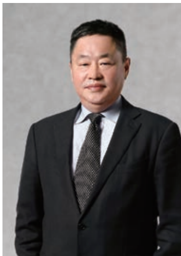
Far East Horizon Limited Chairman of the Board