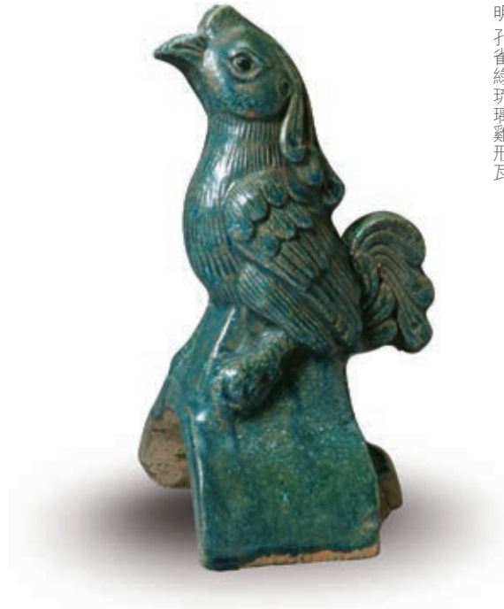
明 孔 雀 綠 琉 璃 雞 形 瓦

The Company will continue to enhance its corporate governance practices as appropriate to the conduct and growth of its business and to review such practices from time to time to ensure that they comply with the CG Code and align with the latest developments.