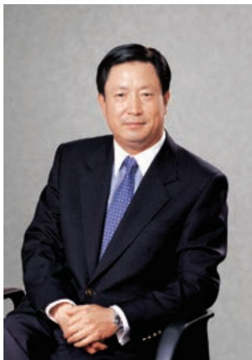
Far East Horizon Limited