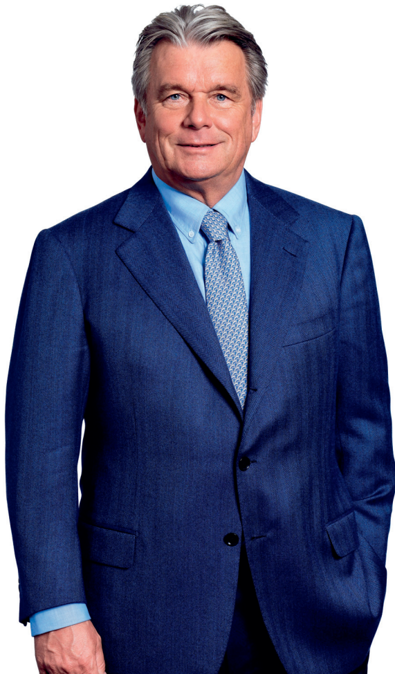
DR. HANS PETER HASELSTEINER CEO