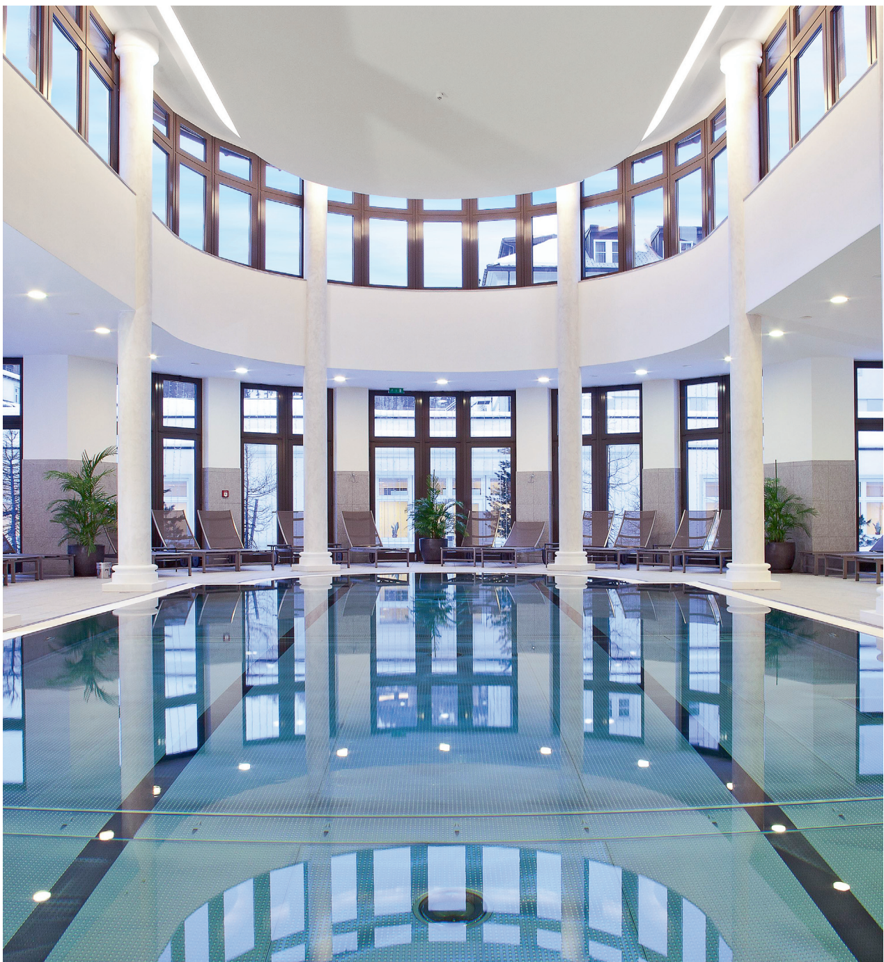
KEMPINSKI GRAND HOTEL, ST. MORITZ

Decisive for the higher forecast were the positive contributions from Germany and Poland as well as the positive developments in the niche markets. STRABAG therefore continues to place a special strategic focus on intensifying its activities in these business fields and on expanding in the northern European markets.