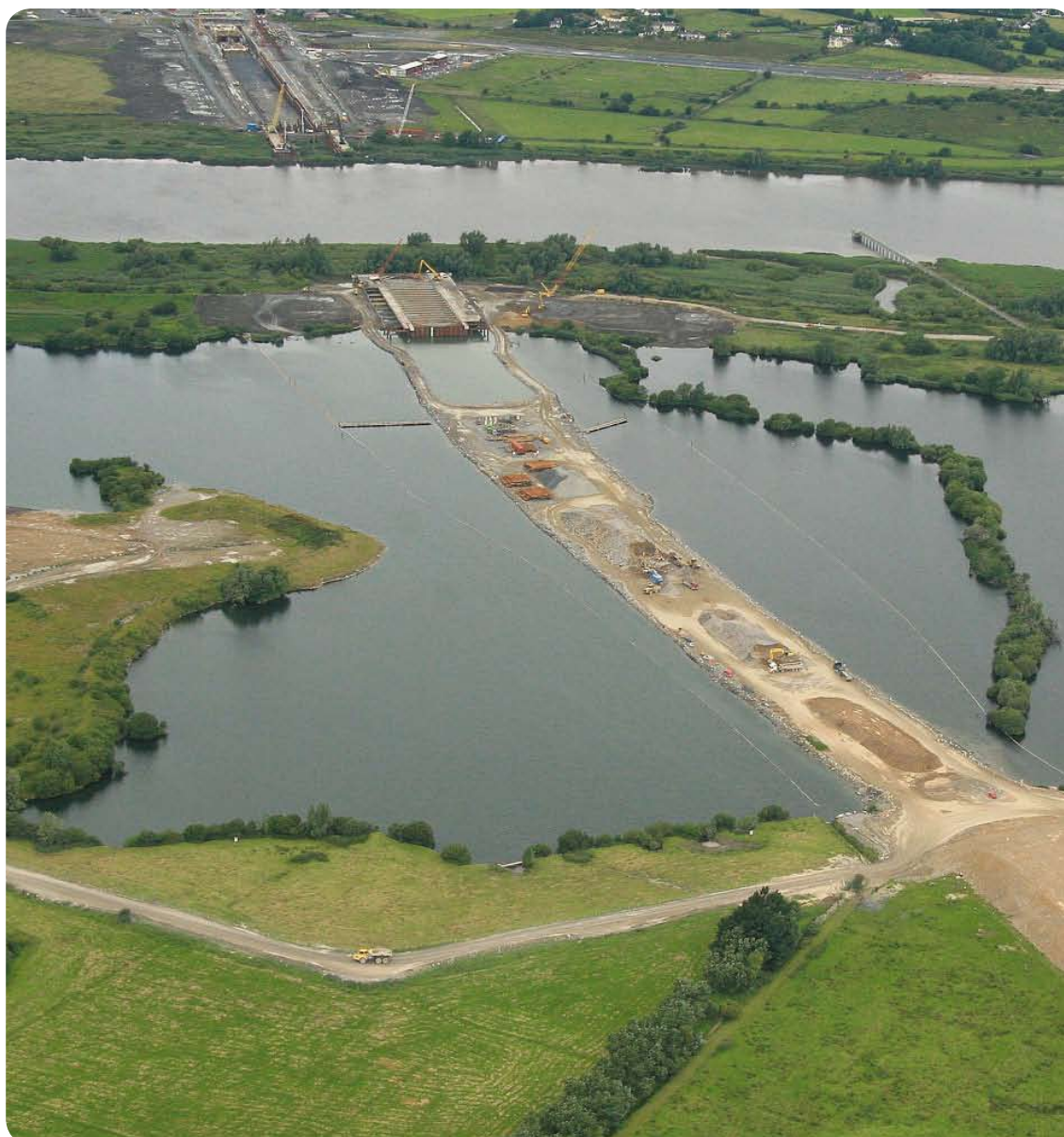
Limerick Bypass, Ireland