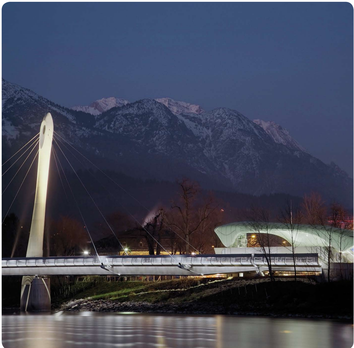
Nordkettenbahn, Hungerburgbahn, Innsbruck, Austria

Goodwill assets are subject to an annual impairment test in accordance with IAS 36. The impairment test is carried out in the last two months of the financial year. Effective 31 March 2008, there was no indication that goodwill impairment was necessary.