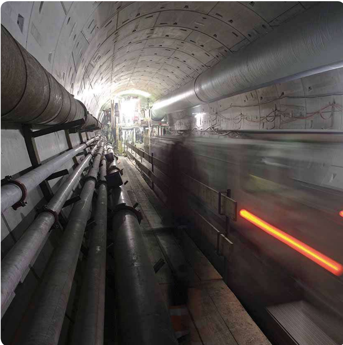
Staten Tunnel Randstad, Rotterdam, Netherlands

The Tunnelling Business Unit is currently preparing to bid for projects in Switzerland, Austria, Italy, Ireland, Belgium and Sweden, among other places. The management expects that the generally low price level in tunnelling in the core markets can be balanced out by the higher margins in STRABAG's newer markets such as Scandinavia. STRABAG's Infrastructure Development Business Unit is preparing a bid for Phase II of the M6 motorway in Hungary and for the construction of the A1 motorway in Poland with a total volume of over € 3 billion. STRABAG sees great opportunities in this area, as several other tenders have already been announced. In PPP Real Estate, the STRABAG Group is currently pre-qualified for construction projects worth about € 350 million, while bids for a further € 327 million are outstanding. Particularly in Germany, STRABAG sees a positive situation in terms of demand.