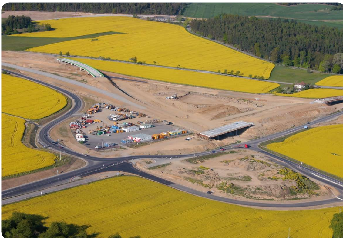
Crosspoint Pisek, Czech Republic

The present interim financial statements for STRABAG SE were neither audited nor subjected to an audit review.