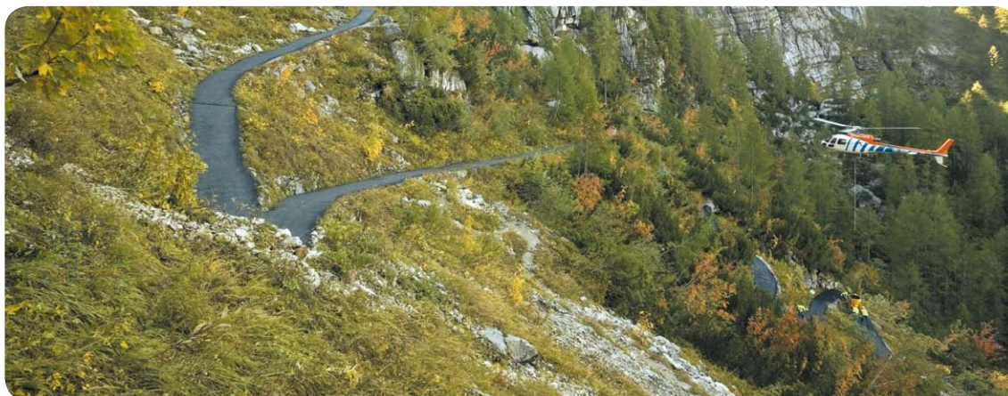
Bituminisation entry cavern system, Dachstein, Upper Austria, Austria