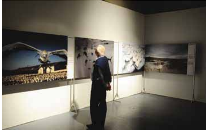
Photo Forum Beirut , May 21. Pecha Kucha 11 , presentations, May 25

Skoun photo competition, May 11 – June 1